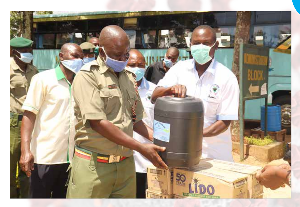
MMUST Union Chapters also took part in the outreach activities

In addition, MMUST has set up a community outreach unit to specifically engage the community in the activities of the University, including COVID-19. MMUST continues to engage the community through its radio station which reaches to listeners as far as Shinyalu, Bunyala, Malava and Khayega.