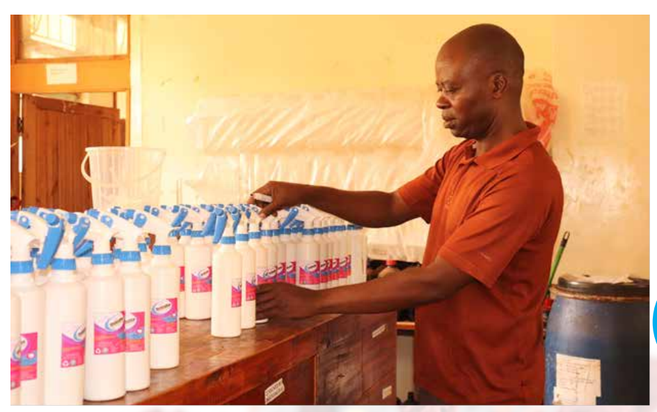
A member of staff working on the production of MMUST sanitizers. The University provided funds to different teams towards combating COVID-19

Masinde Muliro University of Science and Technology (MMUST) is already set for an online graduation scheduled for 18<sup>th</sup> December 2020.