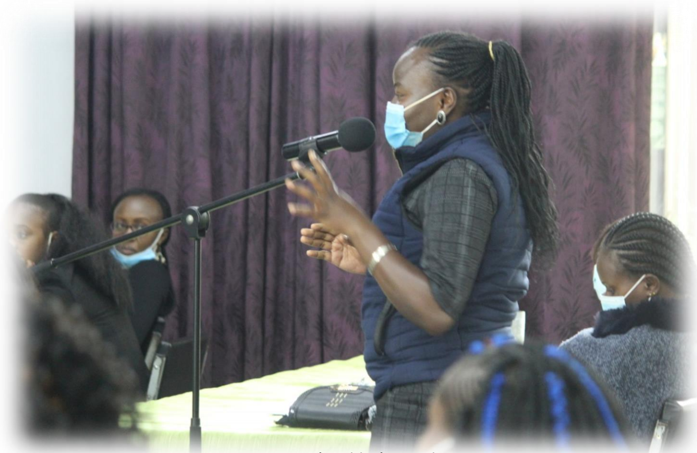
MMUST student giving her experience.