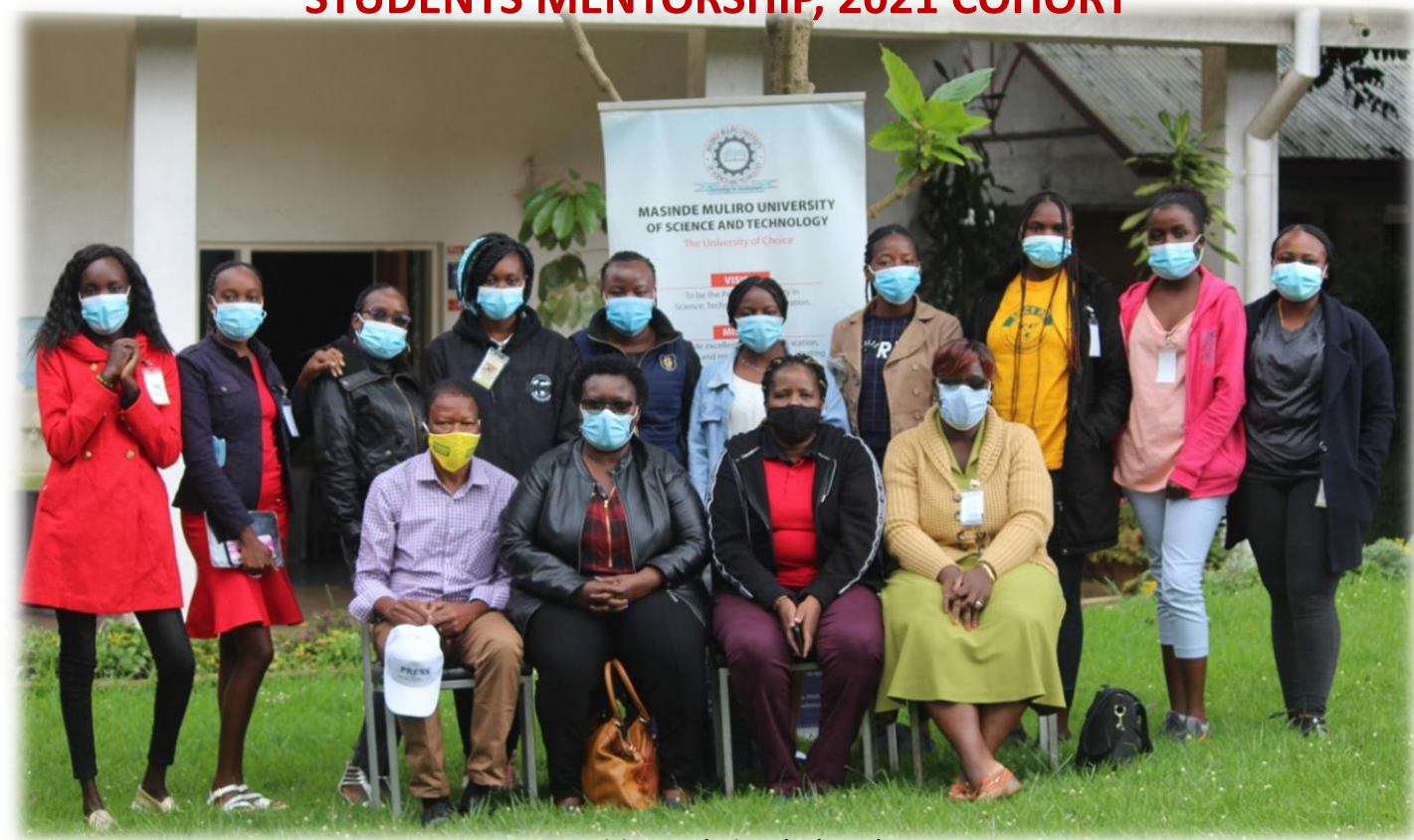
Participants during the launch.

By Marvin Wangatiah [ mwangatiah@mmust.ac.ke ]