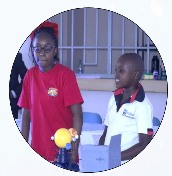
Two pupils enrolled in D-School Digital program making a demonstration of the solar system

towards the CBC. The training should culminate in the award of Diplomas that offer relevant competencies of the teaching profession while also providing a pathway into the University. Teacher Education (TE) now focuses on content, compared to traditional use of grades in TE exams, TTC entry criteria and number of years spent in TTC programs to ascertain competent teachers.