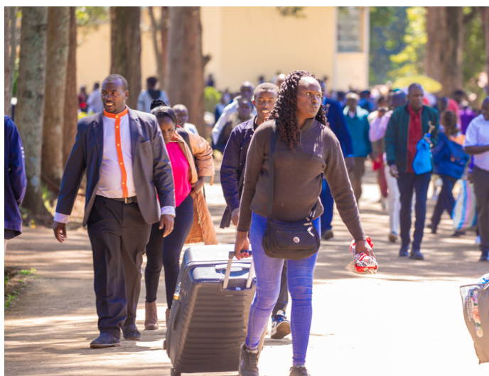
A section of first-years make their grand entry into campus.