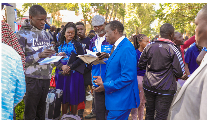
The Vice Chancellor connects with new students and their parents.