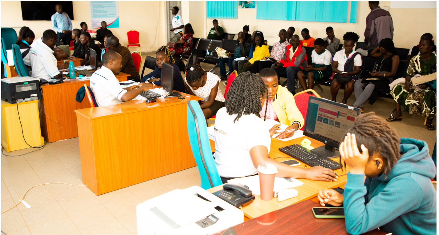
Customer care representatives providing assistance to new students during admission.