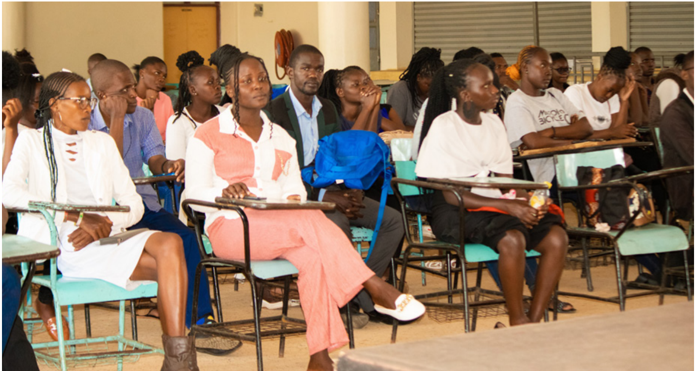
Customer care representatives providing assistance to new students during admission.

M asinde Muliro University of Science and Technology (MMUST) hosted staff and students from Kisumu Polytechnic's School of Business and Entrepreneurship for an enriching field trip visit from 3rd to 5th September 2024. The three-day event, which was held at the main campus' Main Catering Unit, was a collaborative effort that brought together faculty and staff from both institutions. The visit aimed to inspire and guide the Polytechnic students by exposing them to real-world business operations and processes that complement their classroom learning. During the trip, the students had the opportunity to explore various business-related sections within the University, gaining hands-on experience and valuable insights into workplace dynamics.