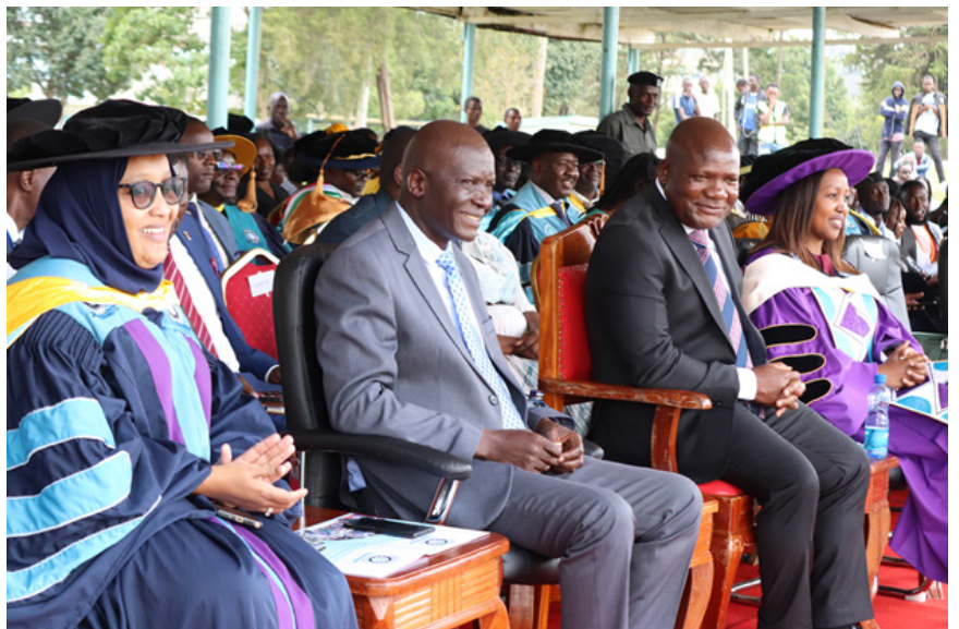
Guests enjoy a light moment of entertainment during the Vice Chancellor's address to first-years.