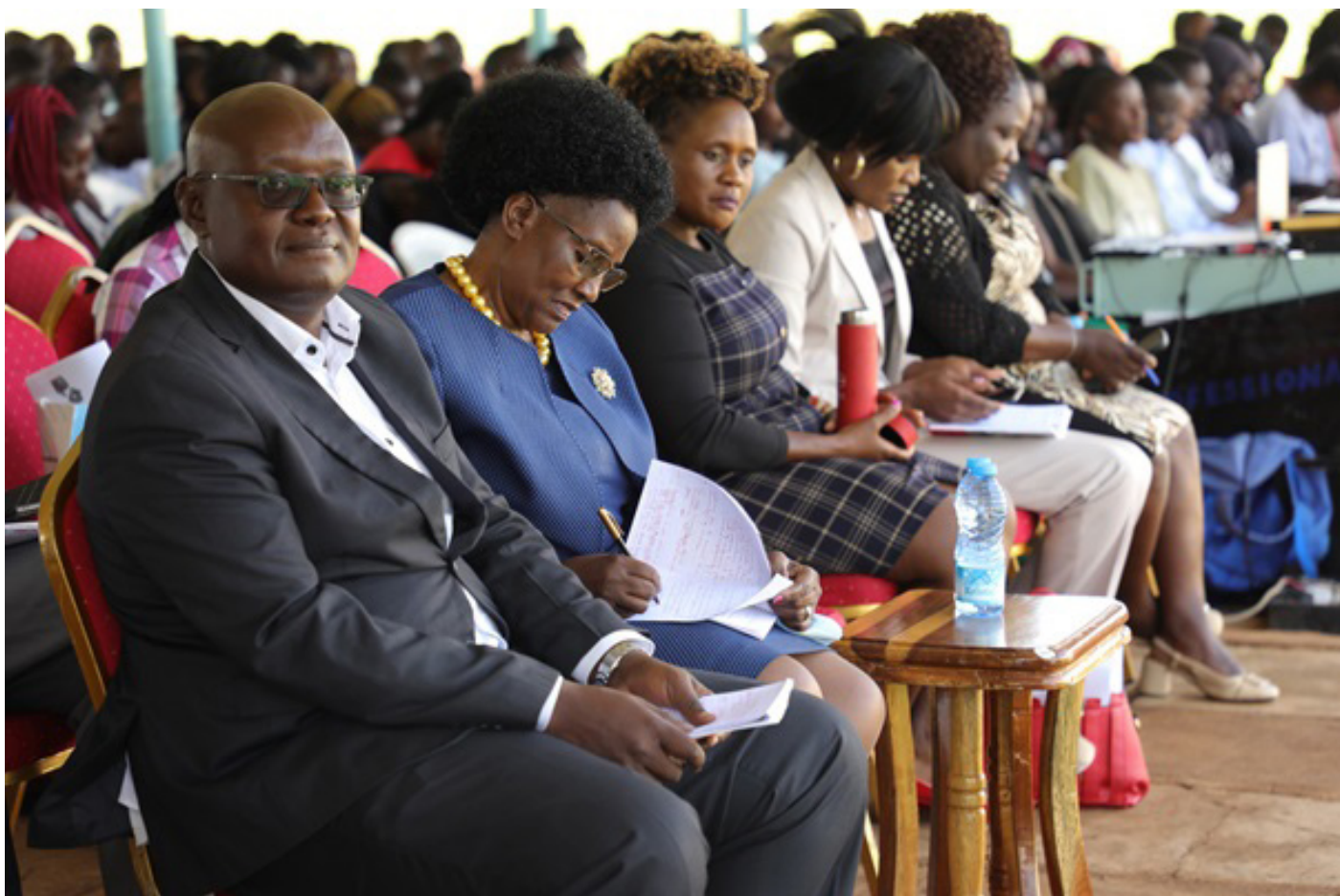
A section of the officers from PRI at the graduation square with MMUST fresh men and women.