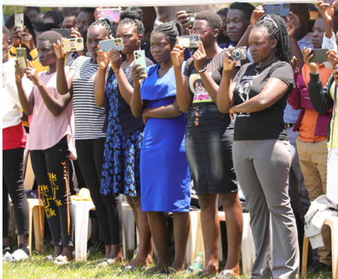
A section of 2024/2025 first-year students at the graduation square.