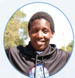
Simon Mwema Photography